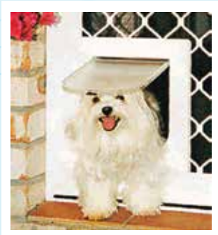
Small - Fitted to Security Door Code: PDS - Small Flap Opening: 240mm x 190mm