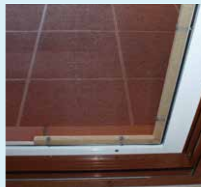
Bracket fitted - inside view

L Bracket is a support bracket to fit the Security Pet Door to Standard Insect Screen Doors