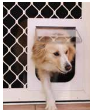
Medium - Fitted to Security Door Code: PDM - Medium Flap Opening: 305mm x 225mm