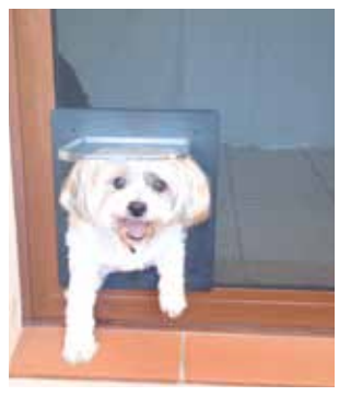
Small - Fitted to Stainless Steel Security Door

Petway recommends using Single-Sided Sticky Back Foam Tape between the two frames to take up the extra gap (Available at your local Hardware) (Refer Stainless Steel Door Fitting Video on our website)