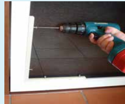
Bracket being fitted - outside view