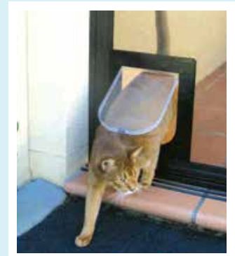
Small - Fitted to Insect Screen Door