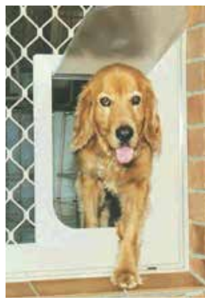
Large - Fitted to Security Door Code: PDL - Large Flap Opening: 400mm x 260mm