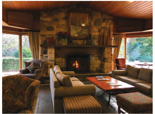
Beautiful interiors at the Mercure Hunter Valley Gardens Resort