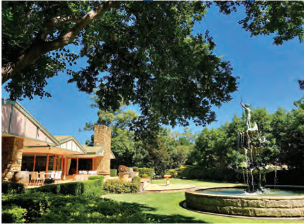
Stunning gardens at the Mercure Hunter Valley Gardens Resort

Another successful AusBoard conference has been held, this time at the Mercure Hunter Valley Gardens Resort.