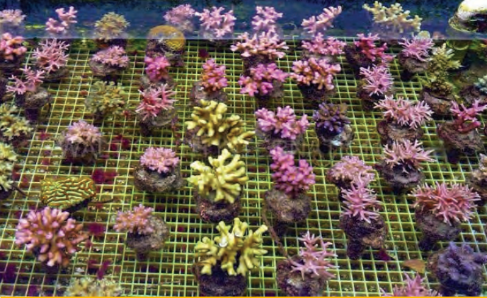
CORAL FRAGS AT WSI: MORE CORAL MASS IS ACTUALLY RETURNED TO FIJI'S REEFS THAN IS ACTUALLY HARVESTED IN THE FIRST PLACE.