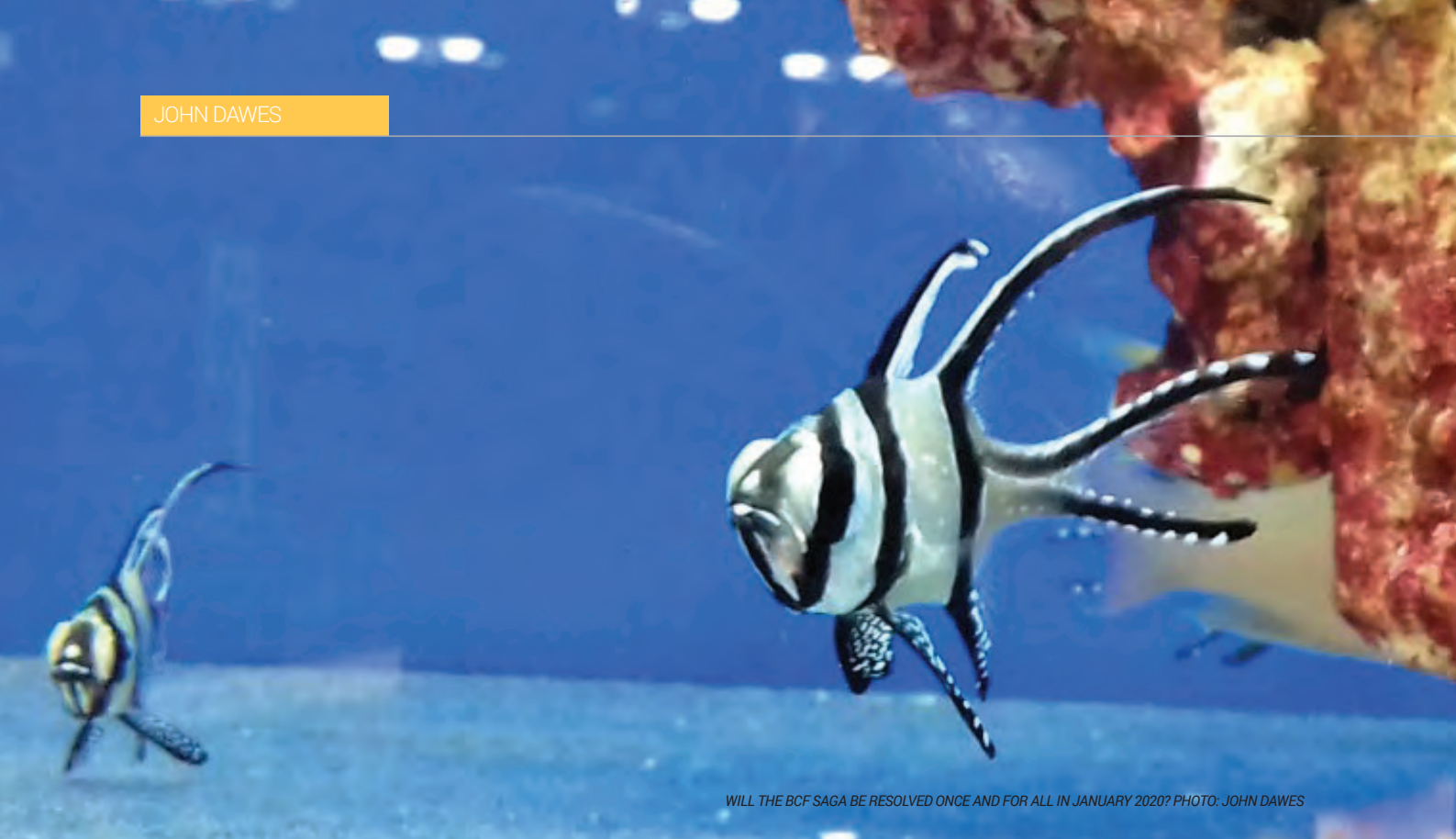
WILL THE BCF SAGA BE RESOLVED ONCE AND FOR ALL IN JANUARY 2020?