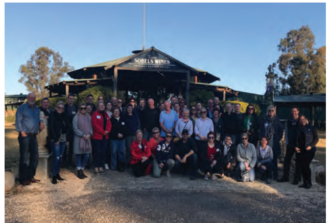
AusBoard delegates at Sobels Wines