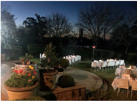
The setting for the Welcome Dinner